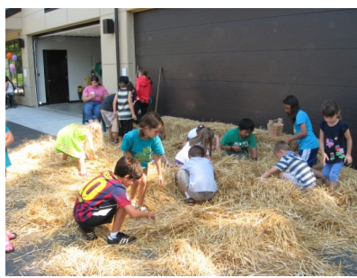
Activities for kids of all ages