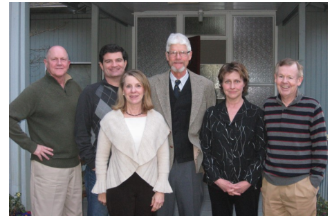
Woodway Town Council