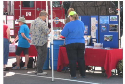
Community organizations inform residents