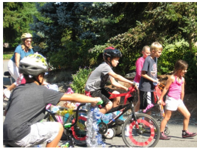
The parade includes kids on bikes and scooters, the band, fire trucks, and the police car.